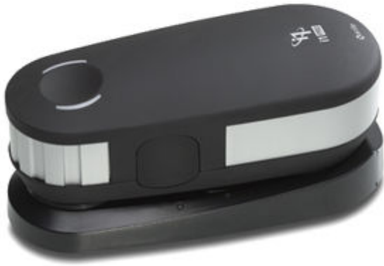
XRite I1 Pro EFI ES 1000