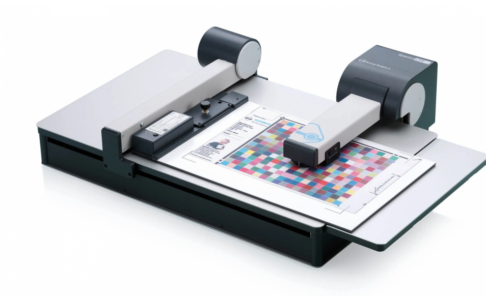
Barbieri LFP qb Sensing Unit